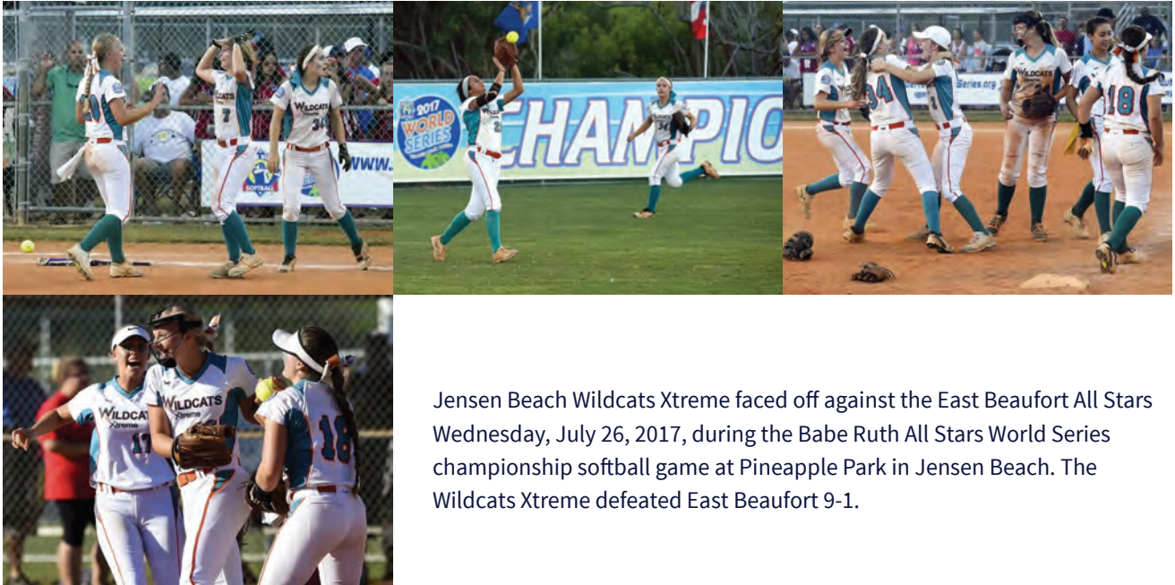
Jensen Beach Wildcats Xtreme faced off against the East Beaufort All Stars Wednesday, July 26, 2017, during the Babe Ruth All Stars World Series championship softball game at Pineapple Park in Jensen Beach. The Wildcats Xtreme defeated East Beaufort 9-1.

https://www.tcpalm.com/picture-gallery/sports/local/2017/07/26/babe-ruth-world-series-softball-championship-game-in-jensen-beach/104033100/