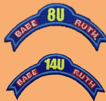
Age Rocker Patch