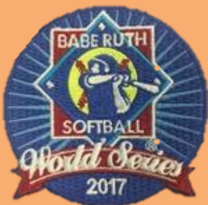
2017 World Series Patch