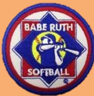
Official Babe Ruth Softball Patch